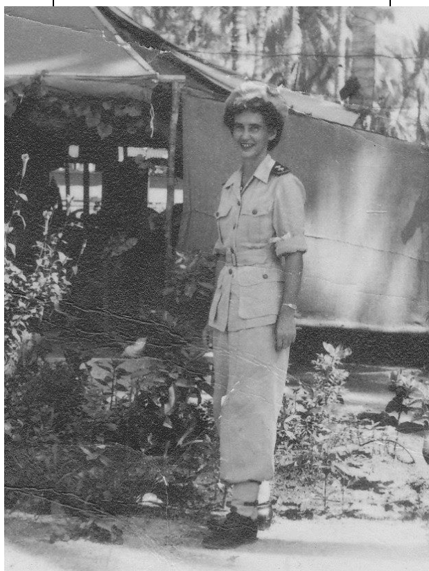
AANS sisters to join the men.